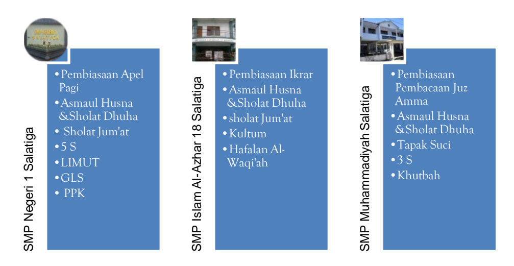
Figure 2. Value Planting

The exposure to the above habits indicates that the school is a school that actually implements character education, characterized by some activities that can foster good character in the learner. Based on the fact, many parents who want their children to go to school with the aim that their children not only intellectual smart but also smart moral, in other words want his son has a good character. The strategy of planting value and character that is by using model Scientific approach, Discovery, Inquiry, Problem based learning. The use of values and character building strategies is tailored to the material taught by the teacher.