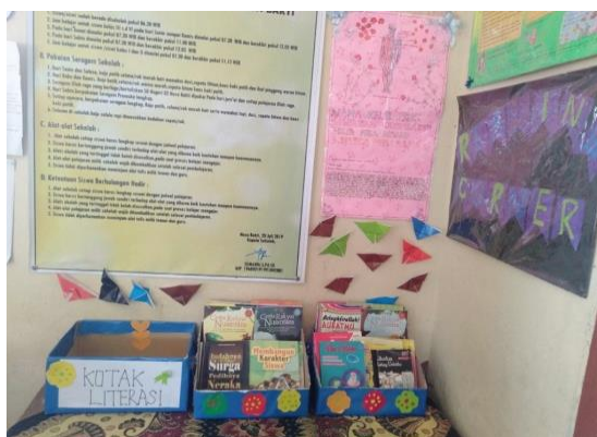
Figure 1. Reading Corner of Class V at SDN 02 Nusa Bakti, South Sumatra

the programs initiated by elementary schools to increase students' interest in reading. The corners in every corner of the class with a collection of storybooks and supporting textbooks (Wulanjani & Anggraeni, 2019). The reading corner in at SDN 02 Nusa Bakti, South Sumatra, Indonesia was showed in Figure 1.