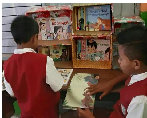
Figure 3. Students reading activity before classroom learning

characteristics and desires of students. Teachers at SDN 02 Nusa Bakti, South Sumatra, stated that this activity was carried out in two ways, including at Monday, he gave an example to students about how to read fairy tales. Then, from Tuesday to Saturday, each student is given the task to read a fairy tale in front of his classmates and also followed by clear intonation and body movements. The student's activity in the reading corner as shown in Figure 3. The students interested to open the book and read it before entered the class.