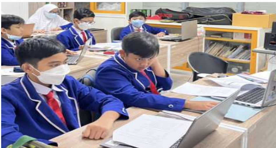
Figure 1. Student Learning Activity by Using Online Application

Additionally, this research discovered that the role of ICT as a learning medium is implemented in thematic learning in the Islamic Education of 6 th grade using a variety of applications that are constantly evolving with the times. As shown in Figure 1, these applications can take the form of PowerPoint, Canva, Quizizz, Kahoot, Google Forms, and various other gamification that can be accessed via devices such as laptops, mobile phones, and computers.